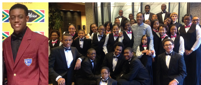
Left to right: Composer Ralvell Rogers II and Members of the Kansas City Boys Choir and Kansas City Girls Choir.